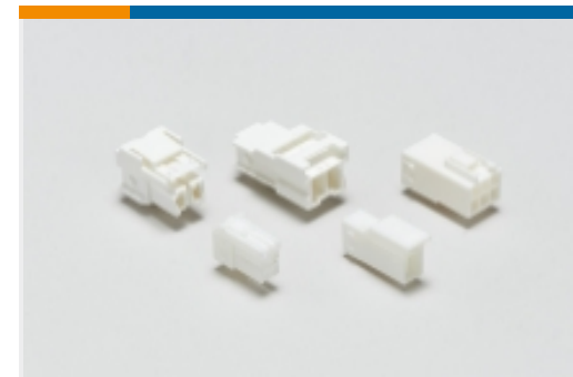
Rectangular Power Connectors(170)